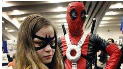
Who was that masked woman? Comic book fans come dressed to party at WonderCon in S.F. Photos