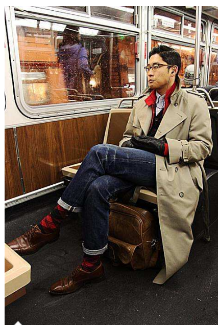
A photo from Gautam Sodera's blog captures a USF law student looking stylish on the 5 bus.

PRINT E-MAIL SHARE COMMENTS (0) FONT | SIZE: +